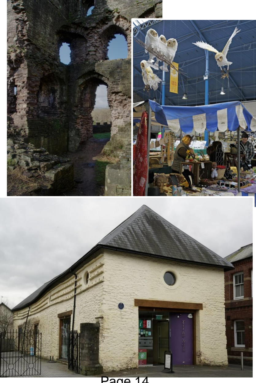
Page 14 Page 13 of 29