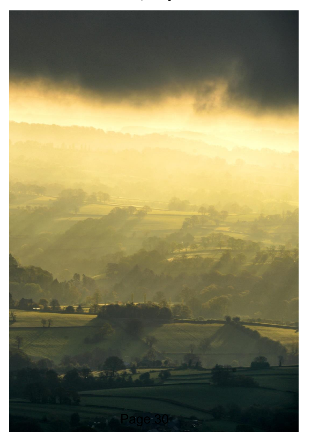
North Monmouthshire Community Planning For a Better Place – Version 0.91